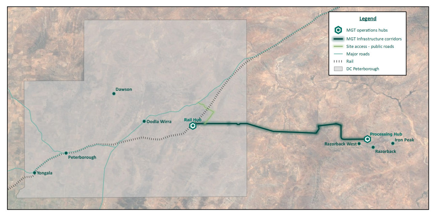
Figure 1. District Council of Peterborough area and the Razorback Iron Ore Project

A ceremonial signing of the MOU is to be held in Peterborough on Friday 5 May with the Hon Geoff Brock MP and Minister for Local Government, attending as a mark of this significant milestone. A community information session will follow to give local residents and businesses the opportunity to share their aspirations about the Project and learn more about Magnetite Mines development plans.